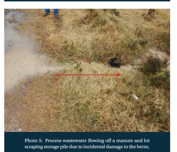
Recent inspections have revealed that manure piles continue to be the most prevalent source of unauthorized discharges from livestock auction AFOs and CAFOs (Photo 3). During an inspection of a livestock auction in 2018, inspectors observed a stream adjacent to the facility which was covered in a thick layer of duckweed from bank to bank. Oftentimes, vegetation like this can be a sign of excess nutrients in the stream. The inspectors were eventually able to determine that process wastewater coming off uncovered manure piles and open lots flowed towards and eventually discharged into this stream (Photo 4). At another facility investigated by EPA in 2019, routine maintenance to irrigation lines damaged a berm intended to convey wastewater to the facility's lagoon (Photo 5). This incident resulted in multiple discharges of process wastewater from a manure